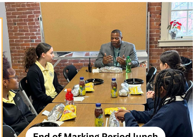
End of Marking Period lunch with the principal.

As we embrace the challenges and opportunities ahead, let us remain committed to supporting our students' success every step of the way.