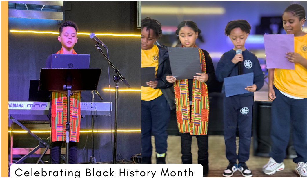
Celebrating Black History Month

In February, Dawn Treader Christian School eagerly embraces a month filled with both learning and celebration. This special month highlights two important events: the 100th Day of School and Black History Month.